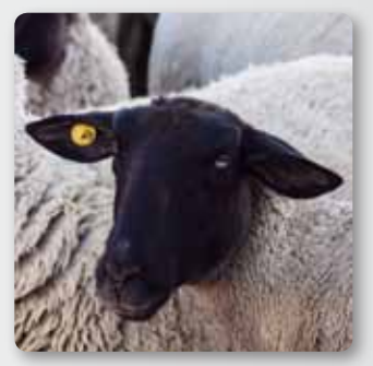
RFID technology is the heart of the Osborne FIRE System. Each animal is uniquely identified with an RFID tag.