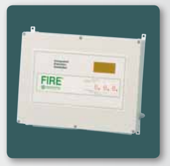
Integrated Function Controller automatically operates each unit, collects and stores data.