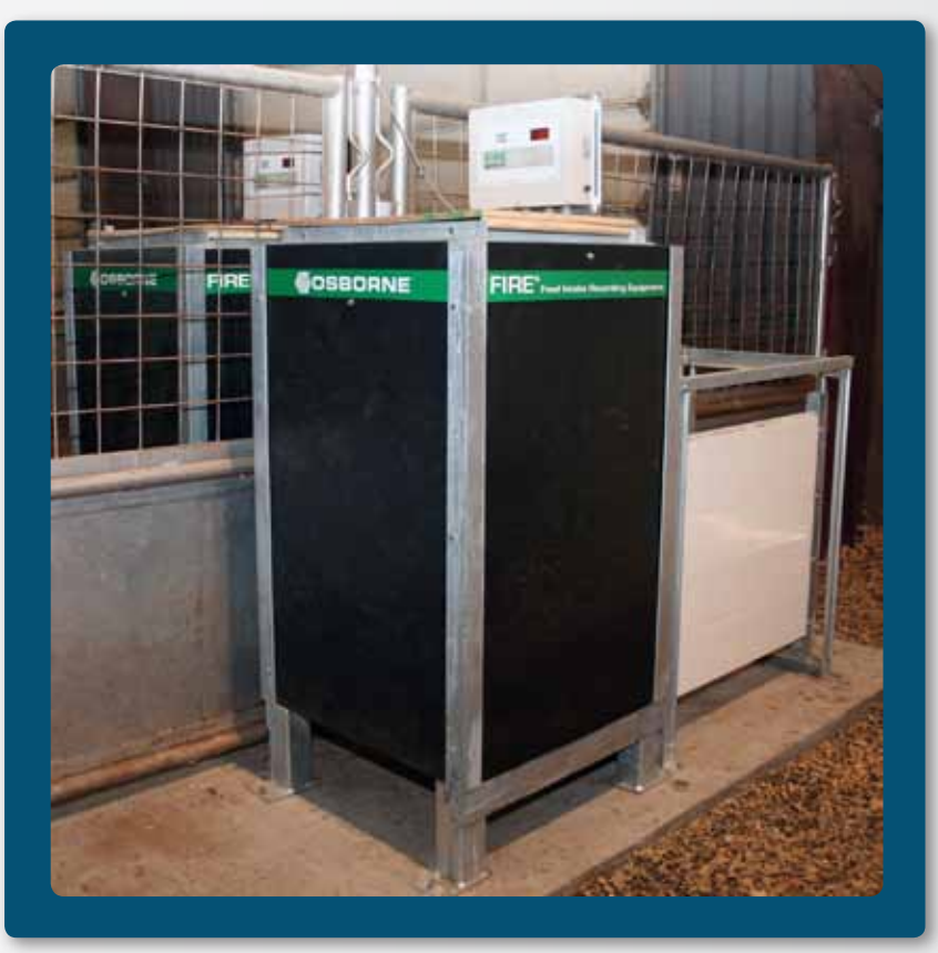
The Osborne FIRE® System automates the measurement of individual daily feed intake and other performance characteristics of growing animals for genetic, feed and pharmaceutical testing.