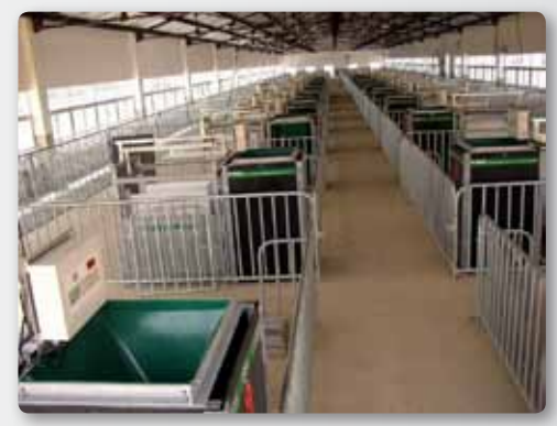
Osborne's FIRE System is the worldwide industry standard for performance testing of livestock. FIRE is the Original Performance Testing System.

Special algorithms and a unique auto-calibration method ensure that data is always accurate when properly maintained. Independent testing and user experience confirm the accuracy of the FIRE System.