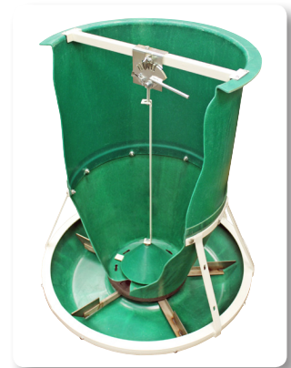
Osborne’s new Fast Start™ wean-to-finish feeder allows newly weaned pigs to start with virtually no attention, adjustments, or wasted feed.

Eakin continued, “The FAST Start Feeder combines gravity-flow feed delivery for newly weaned pigs with mechanical feed delivery for finishing pigs, which saves feed and ensures feed freshness. The conversion of the FAST Start Feeder from a gravity-flow feed delivery to the feed-saving mechanical-flow delivery is done automatically by the pigs. This