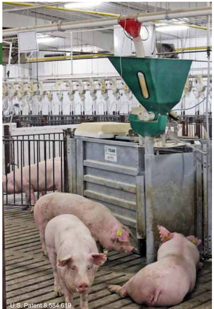
U.S. Patent 8,584,619

The incredibly strong and solid ACCU-TEAM station is constructed with stainless and hot-dipped galvanized steel for longevity and ease of servicing. The cable-free weighing platform and highly sensitive load cells are completely integrated into the feeding station, eliminating the need for a secondary weighing station or platform.