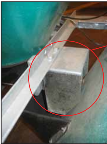
Figure 1 Feeder Splash Guard