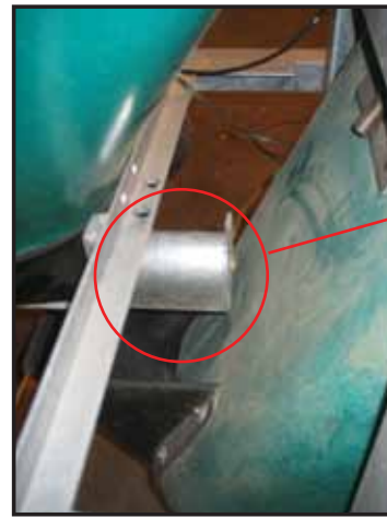
Figure 2 Feed Cup