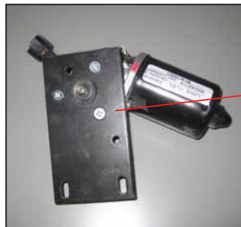
Figure 4 Motor Mount Plate